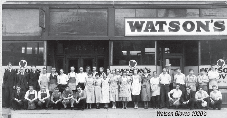
Watson Gloves 1920's