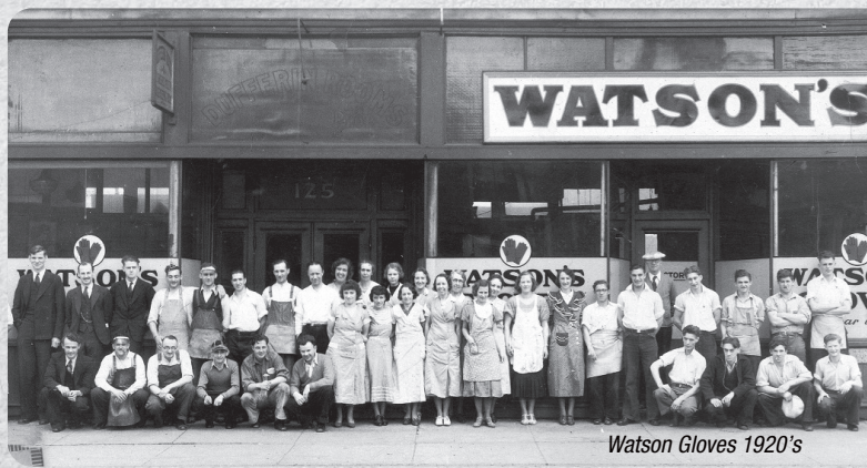
Watson Gloves 1920's